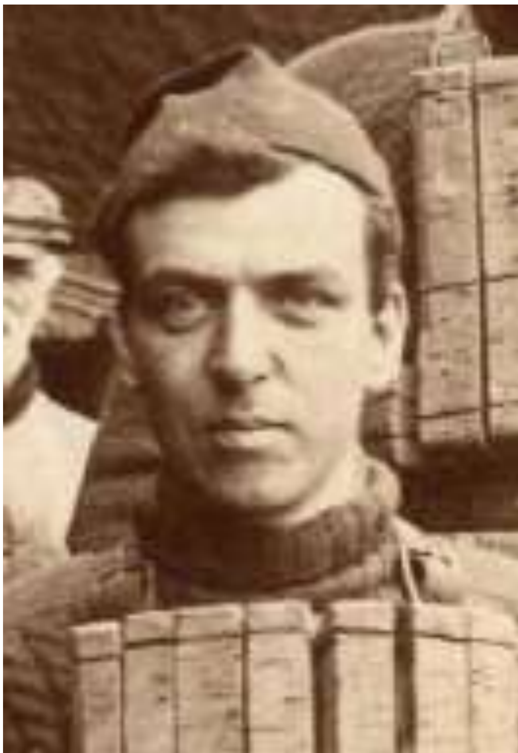
And in this second image he is number 5.